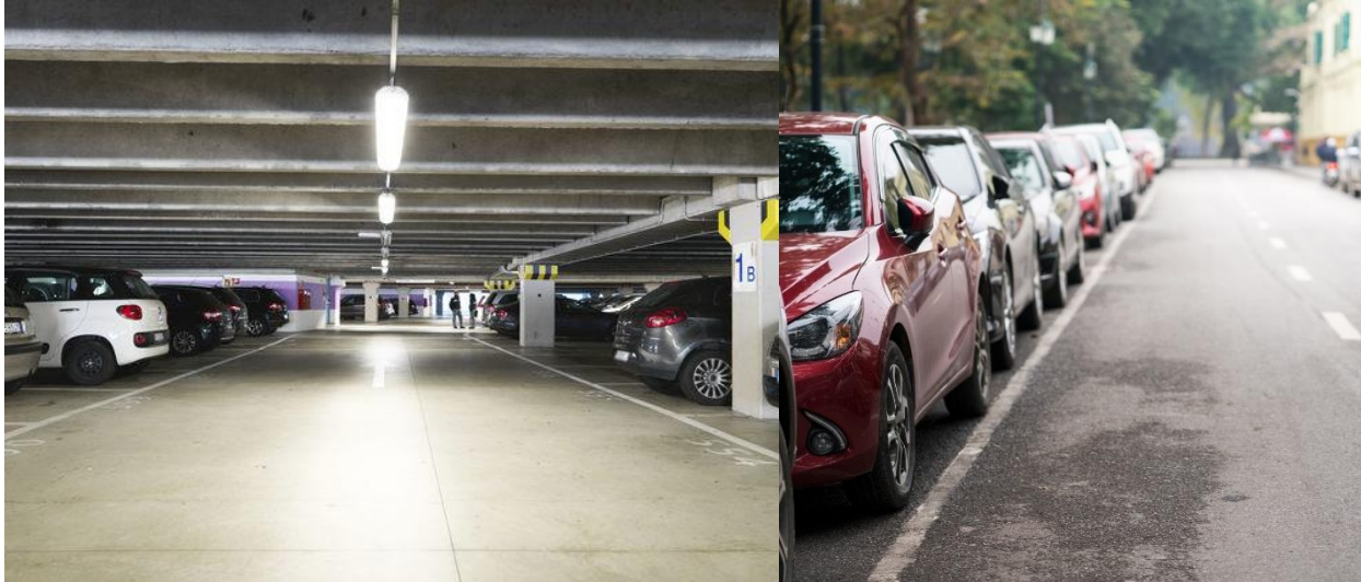
Figure 1: Off-street (left picture) and on-street (right picture) parking.

The market survey covers the design and implementation of a new version of this demonstrative application, which is more suited to present the variety of parking data which is now available. Following requirements have to be guaranteed: