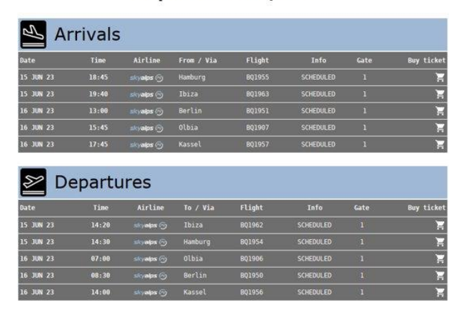
Figure 1: Flight Data Web Component screenshot.

As described in Figure 1, the main usage of the actual version is to display arrivals and departures of flights. By using the configuration panel of the web component, it is possible to personalize the web component (e.g., define the columns to be shown in the table, activate/deactivate real time information, upload a custom CSS, filter out the flight to be shown, etc.).